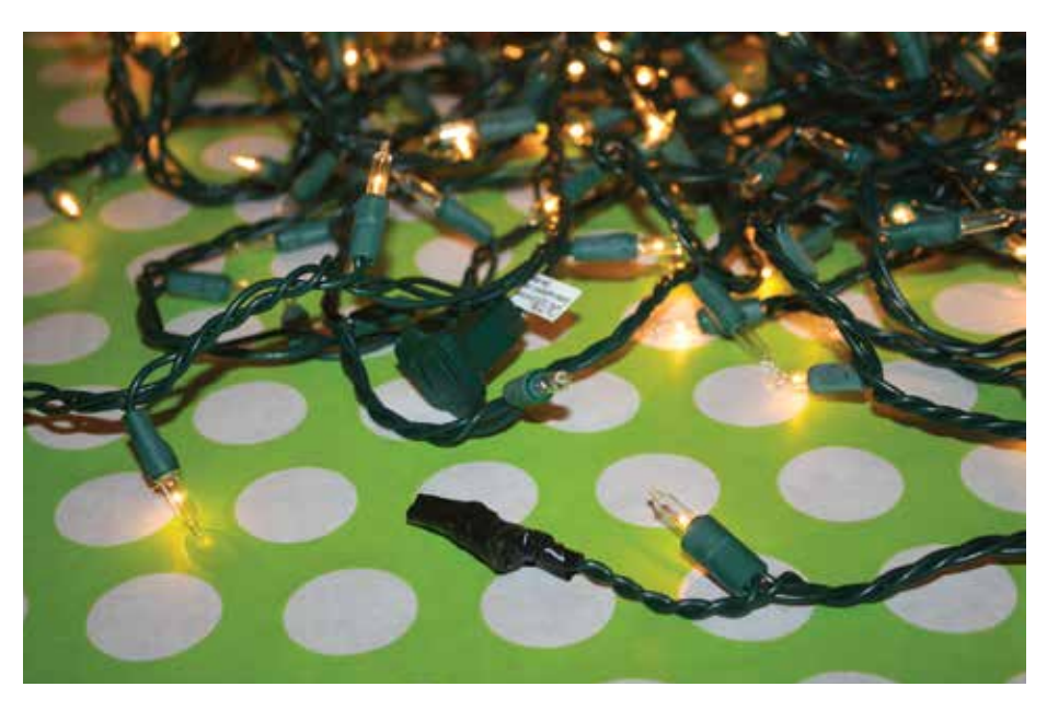
To ensure safe holiday decorating, replace any light strands that show signs of damage, such as bare or frayed wires, broken bulbs, or loose connections. Faulty lights can send an electrical charge through a tree and electrocute anyone who comes in contact with a branch.

Wishing you all a merry and safe holiday season.